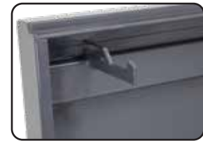
1/4" thick lock tangs for superior protection against break-in