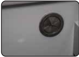
Power Pass™ electric cord pass through (grommet sold separately)