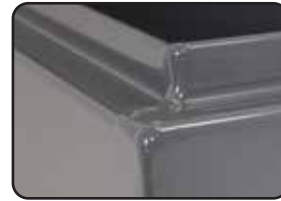
Full arc welded, 16 gauge body construction with powder coat finish