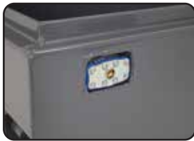
1 time install lock system with recessed housing