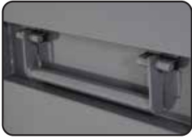
Fully welded recessed handle