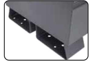
Wide stance, 7 gauge 4 way skid base