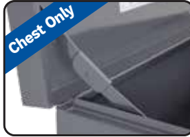
Chest Only Locking lid spreader for safety