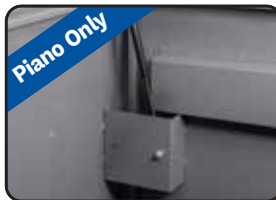
Piano Only Dual lift assist gas springs w/ gas spring guard